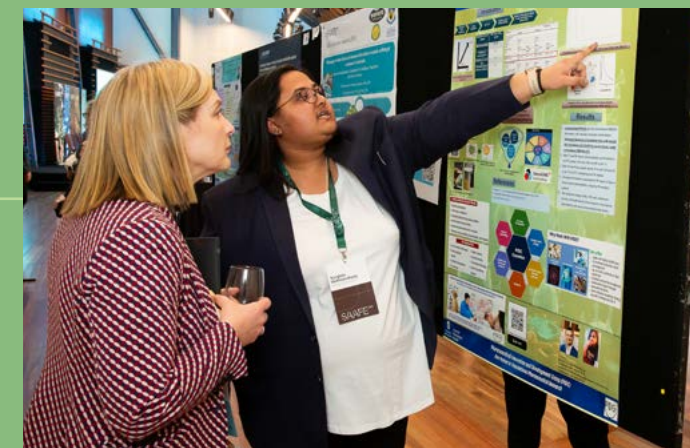
SAAFE CRC SUMMITS 2023 AND 2024, HELD AT THE NATIONAL WINE CENTRE OF AUSTRALIA

This unique initiative will give delegates the opportunity to explore diverse perspectives, identify shared challenges and build new solutions by connecting expertise across human, animal and environmental health.